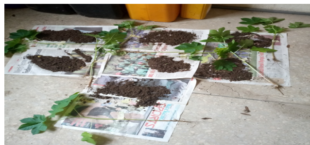
Fig. 1. Parts of castor plant at the point of harvest.

Following the preparation of the soil, about Twelve (12) seeds of the plant ( R. communis ) were planted in the soil at about 3 cm depth. After 3 weeks of plant growth, the number of seedlings was reduced to 2 in a single pot. The plant was allowed to grow for six (6) weeks, after which it was harvested ( Fig. 1 ). The rooted plant was inserted in water to remove soil particles and other impurities and it was then dried in an oven for three days at a temperature of 80°C. The purpose of this step is to get fully dried leaves, roots and stems of the plant.